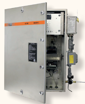
Medor® Exp CSA approved

CSA US TYPE CERTIFICATION CLASS 1 DIVISION 2