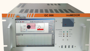
TRSMEDOR - option ppt