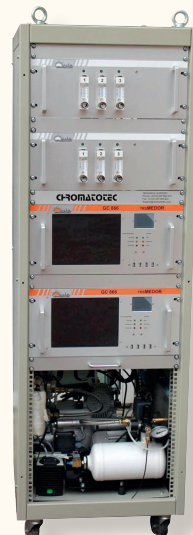
Sulfur compounds analyzer ISO 6326

For odor monitoring and control, airmo S is a sulfur specific analyzer by GC/FPD, from ppb to ppm.