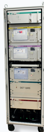
Auto GC/MS 866