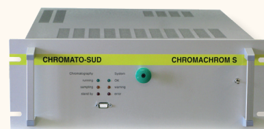
Chroma S - 5U

Concentrations, TRS, TOS and status information (calibrations, streams, default analyzer) are transferred to a central control room.