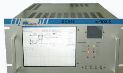
airTOXIC auto GC 866