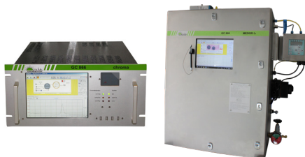
ChromEnergy Analyzer in rack and wall-mounted box

It is available with a custom configuration for safe and hazardous areas: ATEX, IECEx, CSA and CSA international certifications for its application in refineries and petrochemical plants.