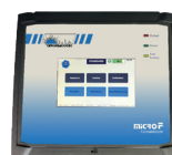
microBTEX BTEX portable analyzer