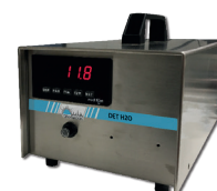
DET H2O Trace Moisture monitoring