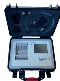
4WAYS 4 ways sampling pumps

This range of portable instruments also includes an automatic multitubes air sampler (4 channels) allowing to program sampling sequences with fast implementation in every environment.