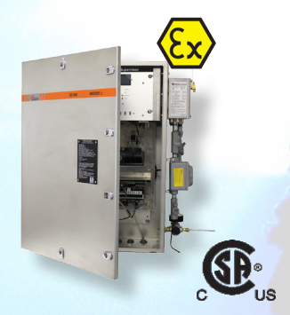
Medor® Exp CSA

Medor®: sulfur in Air. Natural Gas or Biogas