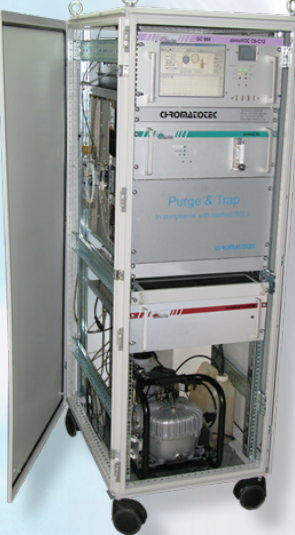
Purge & Trap cabinet