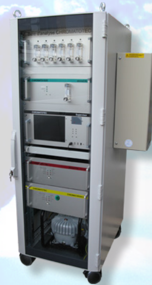
Special airmOzone cabinet